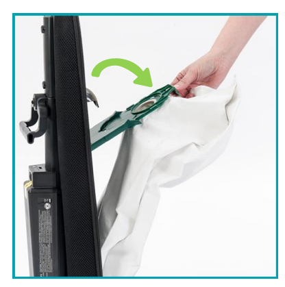
Remove the used vacuum bag by pulling the green bag collar tab away from the vacuum.