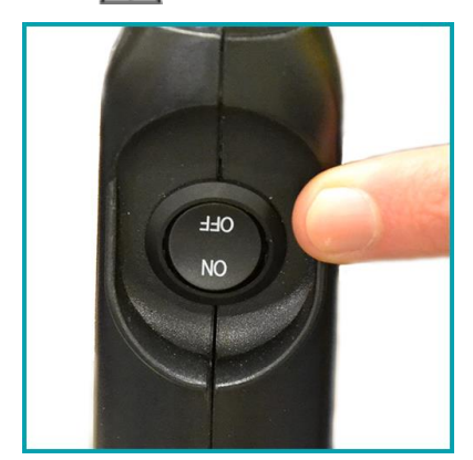
Firstly, ensure that the machine is switched off.

THIS USER GUIDE SHOULD ALWAYS BE USED IN CONJUNCTION WITH THE USER MANUAL