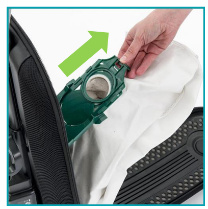
Slide the bag out of the bag holder which automatically seals the bag opening and place to one side.