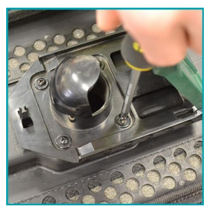
Lay the machine on the floor and undo the 4 screws surround the vacuum bag holder using a crosshead screwdriver.