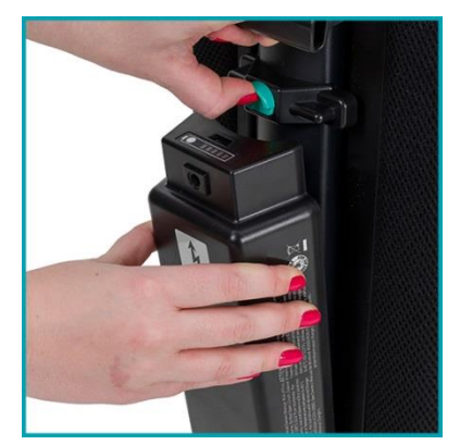
Attach the battery to the machine as shown so that the latch makes a "Click" noise.