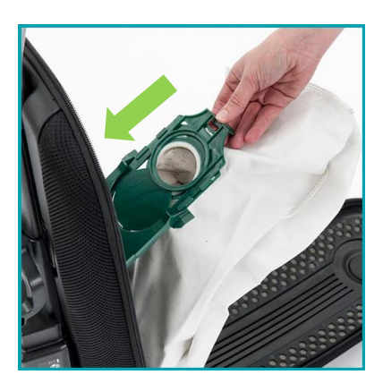
Return the machine to an upright position and slot on the open dust bag. Then Zip up the bag compartment.