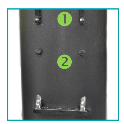
The battery clamp will be positioned between (1) and (2) when assembled.