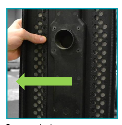
Remove the bag compartment.