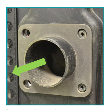
Remove the rubber gasket.