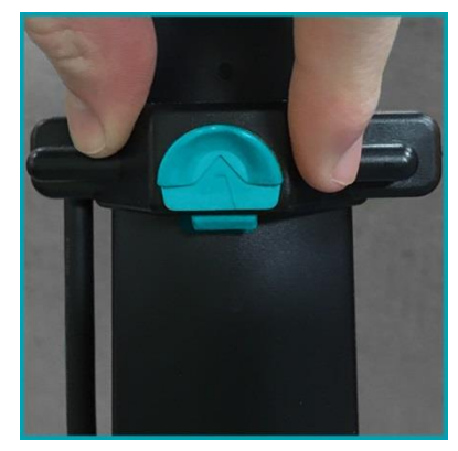
Hold the latch against the reverse side of the handle duct. Note latch orientation.