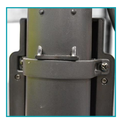
Please note that the battery clamp is currently positioned beneath the lug on the handle duct.