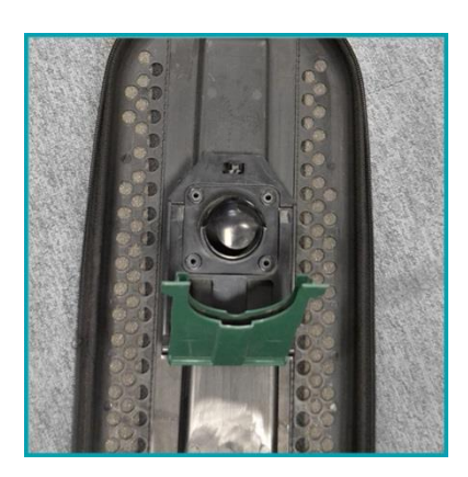
Replace the dust bag holder.