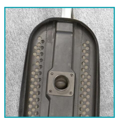
Lay the vacuum on its back and fit the bag compartment (I) onto the machine then replace the rubber gasket (2) so that the screw holes are aligned.