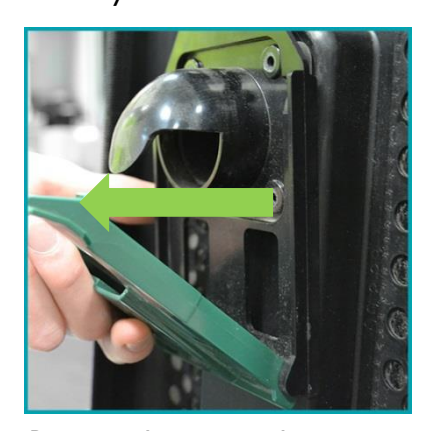
Remove the vacuum bag holder.