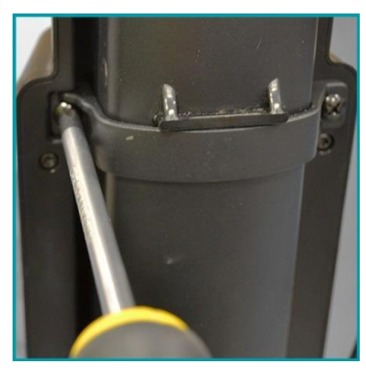
Unscrew the 2 screws in the battery clamp.