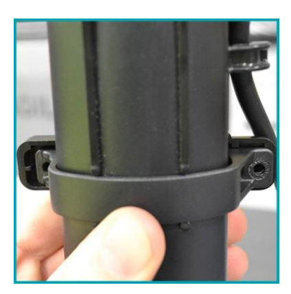
Hold the battery clamp to the handle duct without releasing the latch.