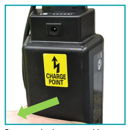
Remove the battery and battery clamp.