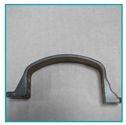
Please note that the battery clamp is not symmetrical.